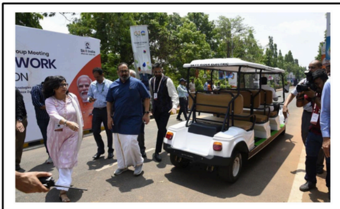
AT G20 FUTURE OF WORK EXHIBITION WITH UNION MINISTER SH. RAJEEV CHANDRASEKHAR AND OTHERS