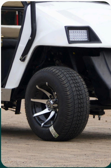
Dual-Purpose Turf Friendly Tyre