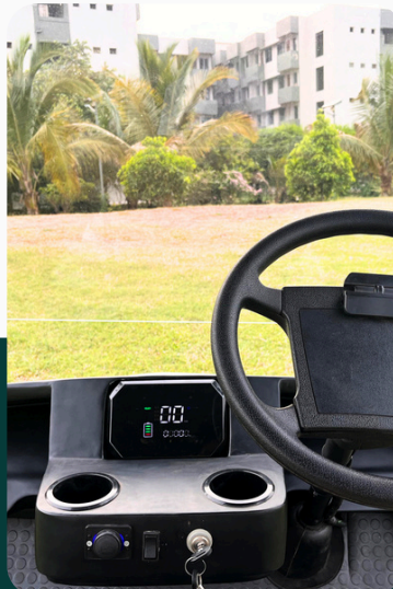
Dashboard Cubby Holes