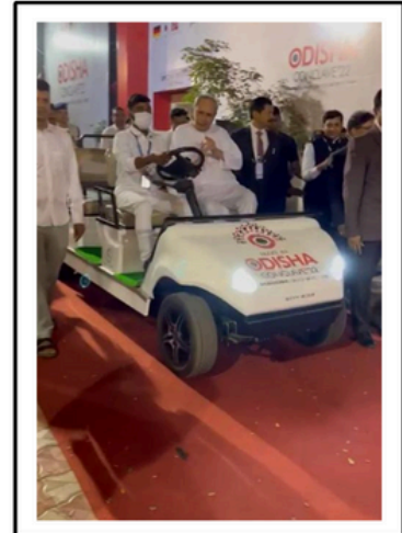
AT MAKE IN ODISHA CONCLAVE'22' WITH HON'BLE CM SH. NAVEEN PATTNAIK