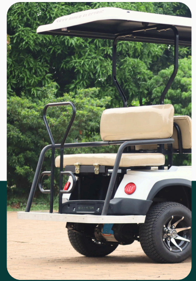
LED Tail Lamps with Indicators