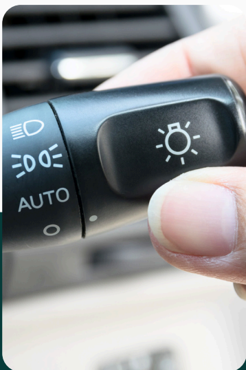
Integrated Combi Switch