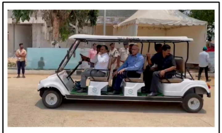
AT ODISHA SKILL CONCLAVE '23 WITH OSDA CHAIRMAN SH. SUBROTO BAGCHI AND OTHERS