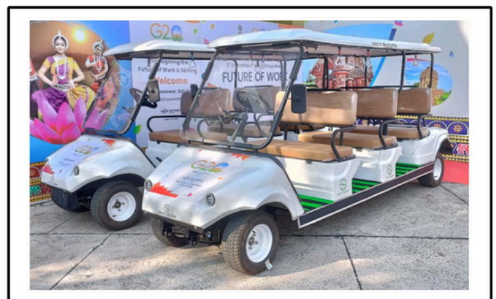
AT G20 FUTURE OF WORK EXHIBITION