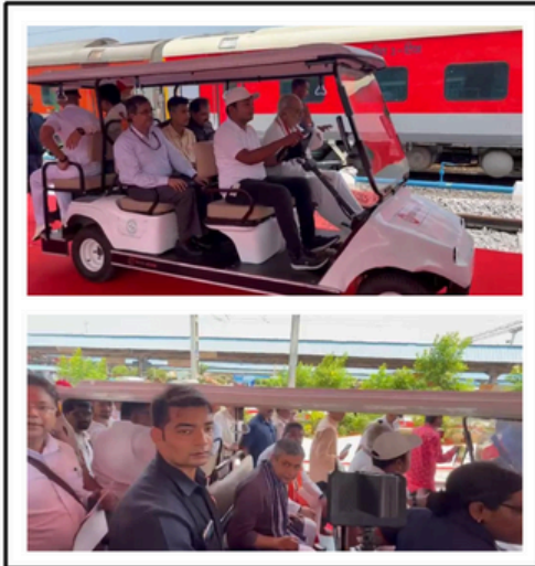
AT INAUGURAL CEREMONY OF VANDE BHARAT EXPRESS WITH HON'BLE GOVERNOR, UNION & OTHER CABINET MINISTERS