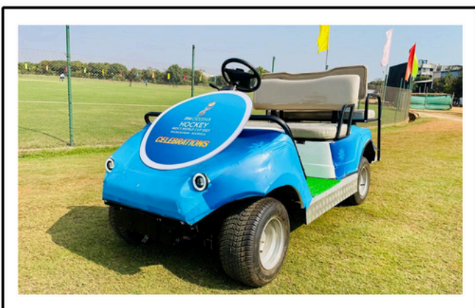
OUR PARTICIPATION AT FIH MEN'S HOCKEY WORLD CUP '23